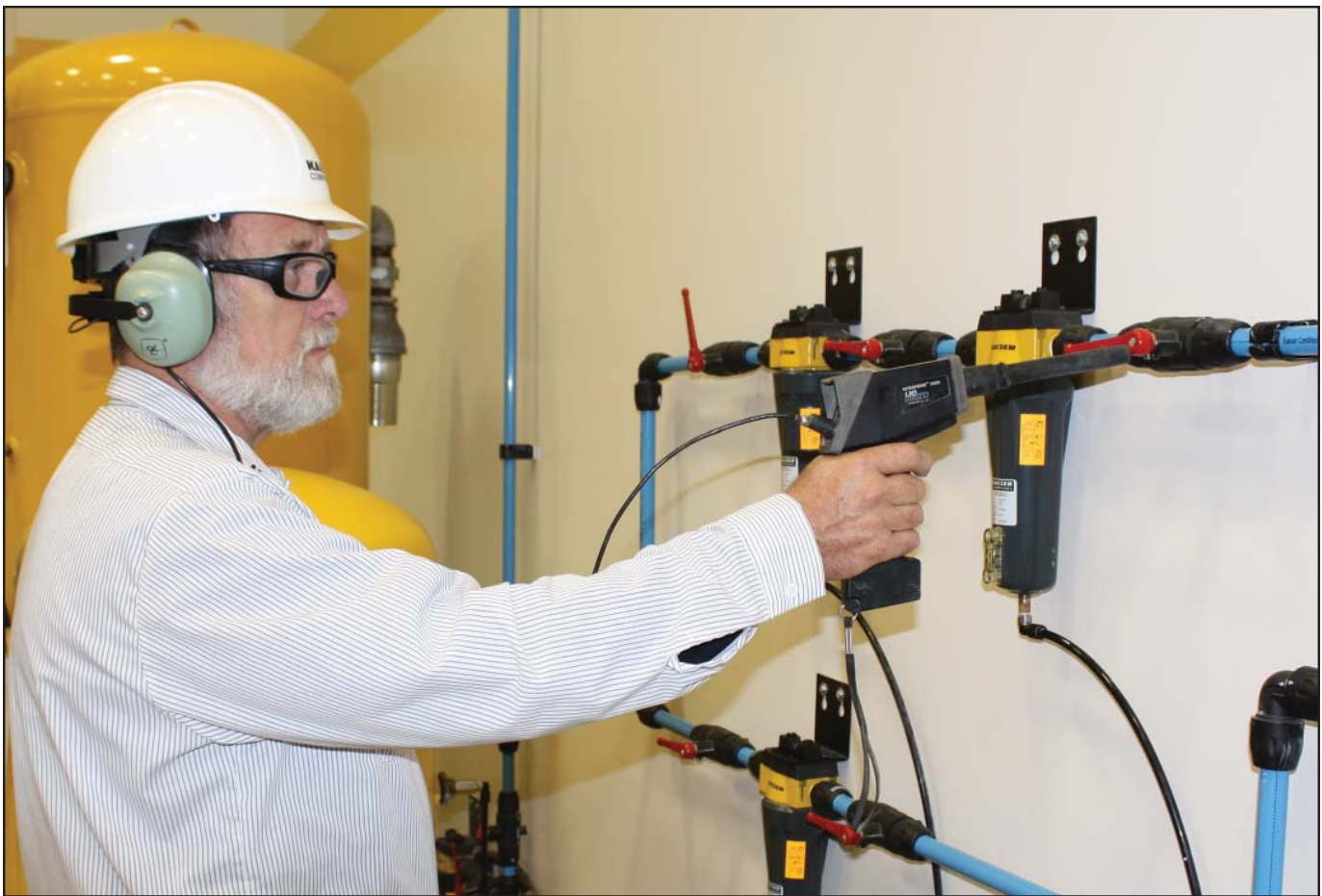
FIGURE 2: Ultrasonic leak detection is versatile, fast, and accurate and it does not require plant downtime.

Since ultrasonic is a high frequency signal, the sound from a compressed air leak is both directional and localized to the source. This allows the ultrasonic detector to sense the leak in loud, noisy environments and locate the source of the leak. Some ultrasonic leak detection devices are also able to estimate and record the volume of leakage based on the decibel level of the leak.