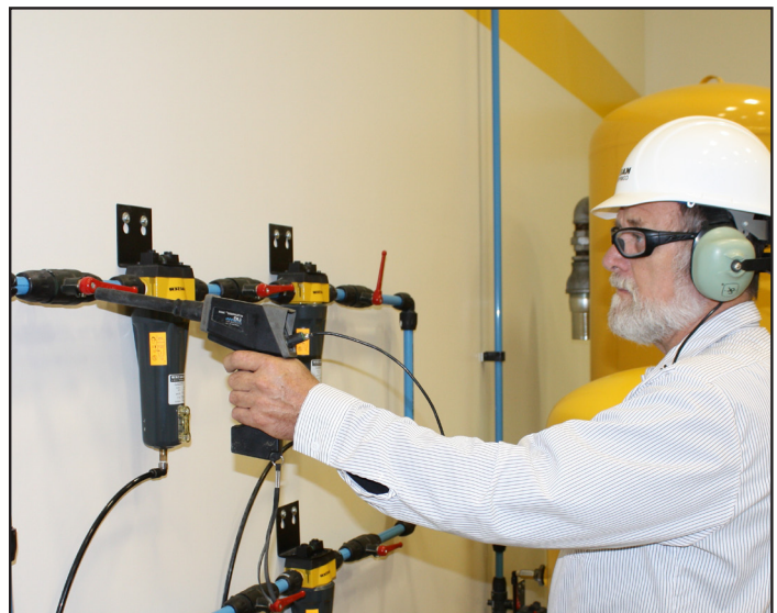
FIGURE 2: ULTRASONIC LEAK DETECTION IS VERSATILE, FAST, AND ACCURATE AND IT DOES NOT REQUIRE PLANT DOWNTIME.

Since ultrasonic is a high frequency signal, the sound from a compressed air leak is both directional and localized to the source. This allows the ultrasonic detector to sense the leak in loud, noisy environments and locate the source of the leak. Some ultrasonic leak detection devices are also able to estimate and record the volume of leakage based on the decibel level of the leak.