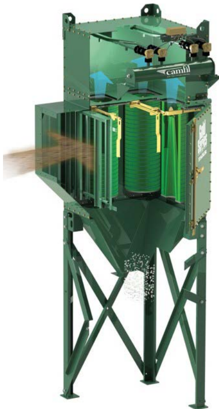
Figure 1: Cutaway view of dry media-type high efficiency cartridge dust collector.

Today's cartridge dust collectors are available with a wide choice of primary filtration media that can achieve very high efficiencies on very fine particulate. Specialized media combine high efficiency with other properties like fire resistance, static conductivity and resistance to adhesive materials. In situations where materials have very low OSHA personal exposure limits (PELs), a HEPA-grade secondary filter can be added to the system to achieve cleanroom grade efficiencies. This is important if the exhaust air is returned to the factory. If the secondary filter is integrated into the main filter housing, it will act as a particulate and flame retention device and provide deflagration protection to the facility. The performance of this type of control would fall under the "Performance-Based Options" in NFPA and would require third party testing to prove that it can control the hazard. Performance-Based Options are described further in the section on Hazard Analysis.