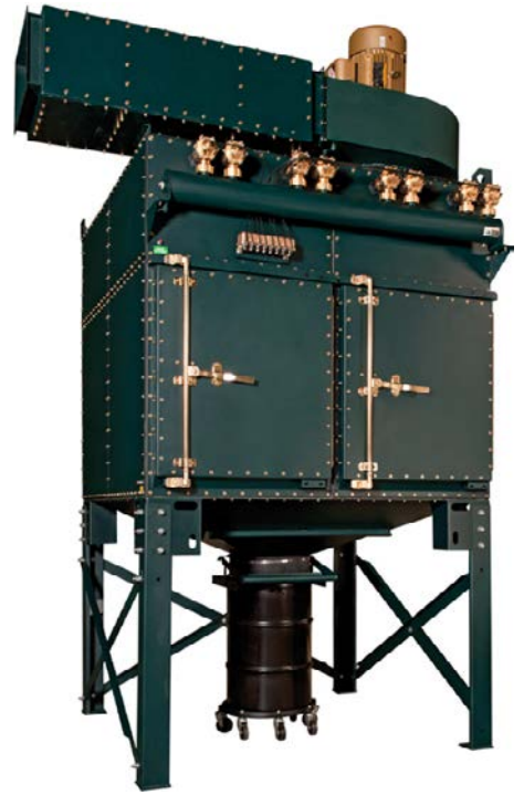
This dry collector uses high efficiency media filter cartridges.

NFPA defines dry dust collectors as cyclone and media collectors such as baghouses and cartridge collectors. This paper focuses on a comparison of high efficiency cartridge collectors and wet collectors. "Dry media" dust collectors that use or contain high efficiency filter media cartridges to capture industrial dusts are popular for a wide range of applications. Typically, dust-laden air enters the collector through a baffled inlet and is collected on the filter media. Periodic bursts of compressed air dislodge the dust