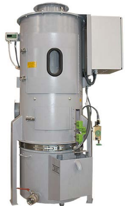
This wet collector is a cyclonic-type scrubber.